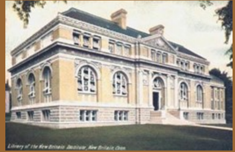
Library of the New Britain Institute, New Britain, Conn.